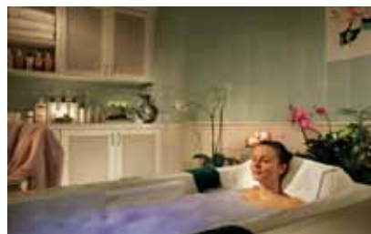
Relax with a Greenbrier Signature Treatment

The Greenbrier Spa has long been one of the resort's most popular amenities. For 229 years, guests have been attracted to The Greenbrier's sulphur springs and the natural benefits of the minerals remain at the heart of The Greenbrier Spa experience. With a focus on hydrotherapy and the use of mineral-based products