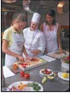
The Greenbrier Culinary Staff is world renowned